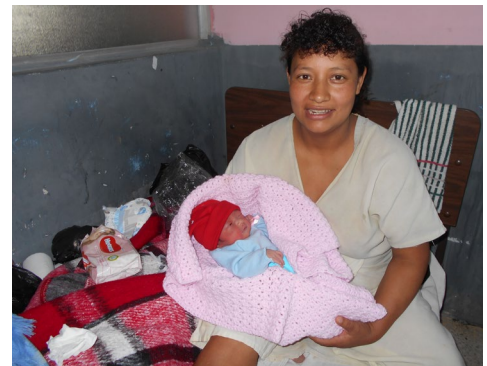
Young Mother in Guatemala with New Crocheted Blanket for Her Baby