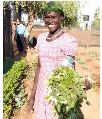
Crops now growing in the new farm is feeding people in Turkana County in Northwest Kenya